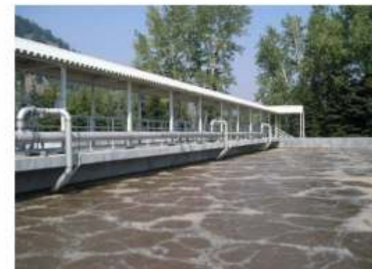
Drinking Water Treatment for Municipality

Our wide range of solutions for surface and ground water treatment remove pollutants ranging from simple silt to contaminants such as arsenic, fluoride, iron, nitrate, organics and salinity. We undertake turnkey projects on EPC or BOO/T basis for water supply and distribution, drinking water treatment, sewage treatment and disposal, sea water intake and desalination, solid waste management and waste-to-energy projects - all backed by operation and maintenance services for continuous, optimum performance.