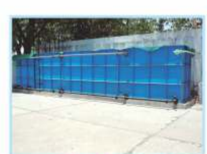
Fluidised Media Reactor at a Hotel