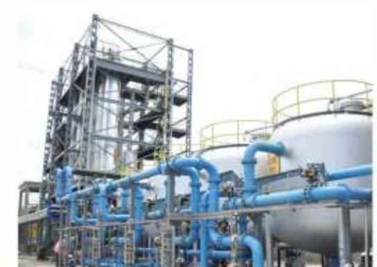
Zero Liquid Discharge System at Synthetic Rubber Plant