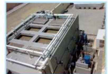
Membrane Bioreactor at Commercial Complex