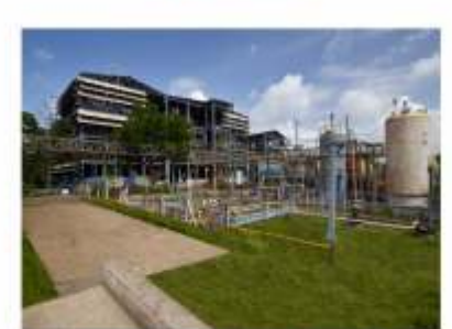
Resins Manufacturing Unit at Ankleshwar, Gujarat