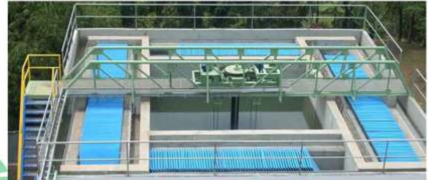
Ultra High Rate Clarifier for Textile Plant

Our comprehensive solutions extend from influent water through potable & process water, effluent treatment, water reuse & zero discharge and waste-to-energy projects. We take great pride in providing 24x7 support service that ensures high performance continuity.