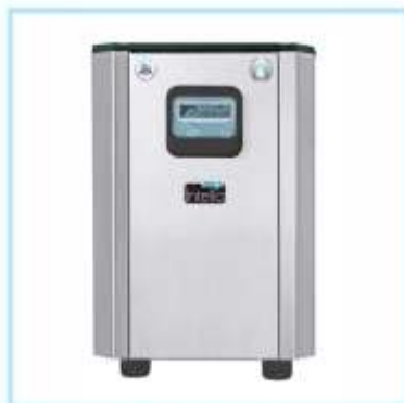
Zero B Intello