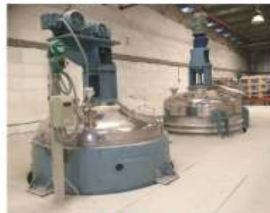
Chemical Blending Plant at Bahrain