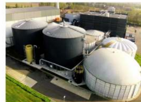
Sludge Digestion - Waste-to-Energy