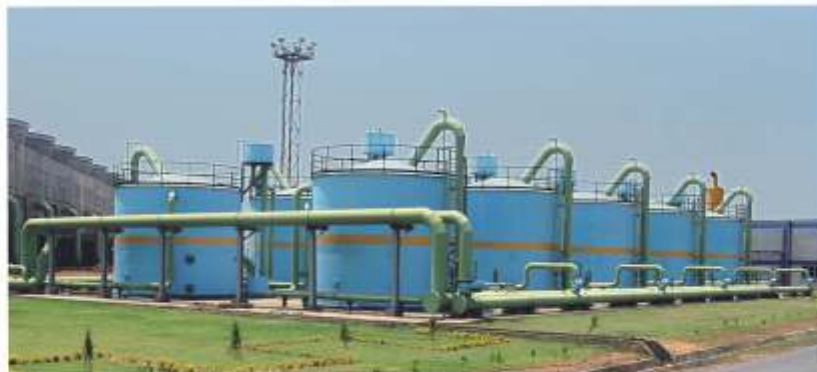
Side Stream Filters at Steel Facility