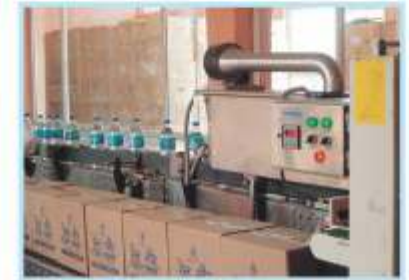
Packaged Drinking Water Plant for Railways