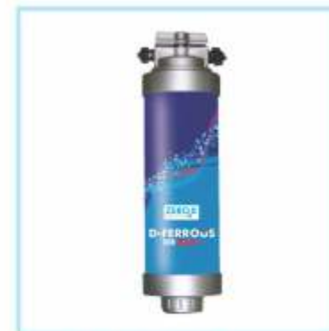
Zero B Iron Remover