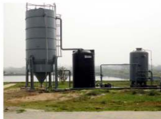
Continuous Sand Filter for Surface Water Treatment