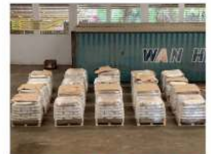
Warehouse & Assembly Centre at Indonesia