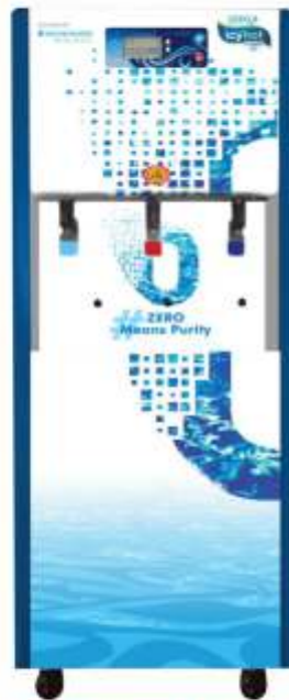
Water Vending Machine