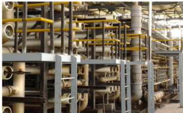
Sea Water Reverse Osmosis (Desalination) at Thermal Power Station