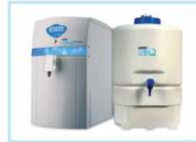
Lab Water Solutions

We offer systems for drinking water purification, swimming pool filtration, disinfection, water conditioning for utilities, treatment of sewage and recycle.