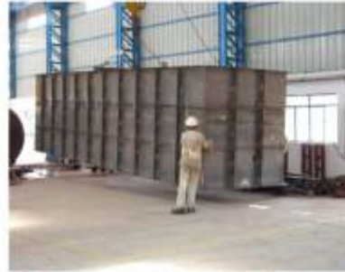
Fabrication & Assembly Facility at Hosur, Tamil Nadu