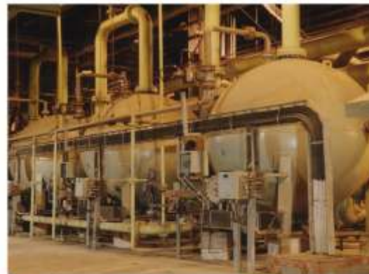
Condensate Polishing Units for Power Plant