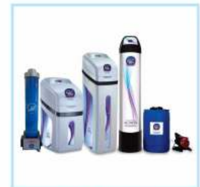
Zero B Softeners