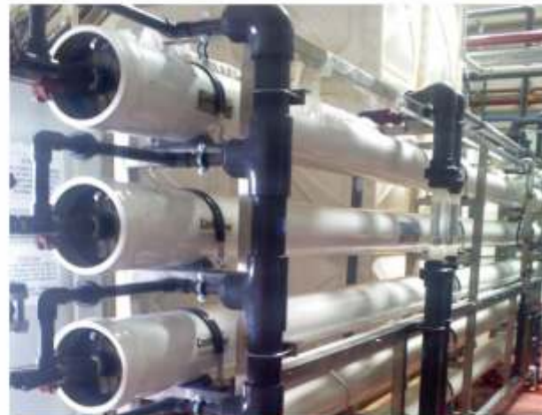
Reverse Osmosis Plant at Food & Beverage Industry