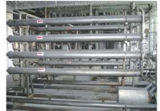
Gelatine Concentration Ultra Purification Unit in Food and Beverage Industry

Speciality process chemicals for the sugar, paper, ceramics, oil refining, mining, steel and textile industries help to increase efficiencies and product quality.