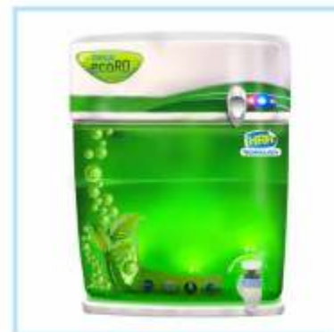
Zero B eco RO