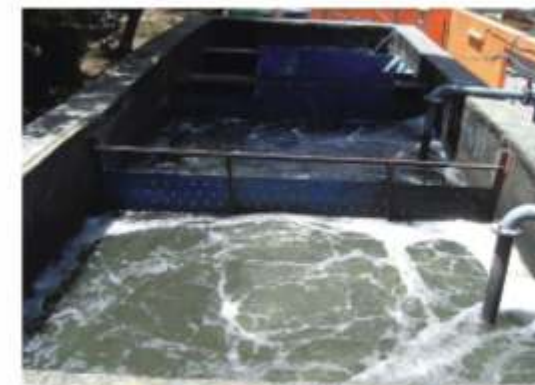
Fluidised Media Reactor for Sewage Treatment & Water Recycle