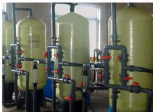
Arsenic Removal Plant for Ground Water Treatment