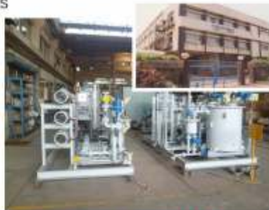
Export Oriented Unit at Rabale, Maharashtra