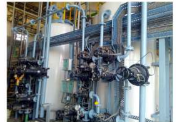
Glycol Purification for Chemical Plant