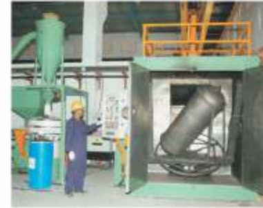
Fabrication Plant at Wada, Maharashtra