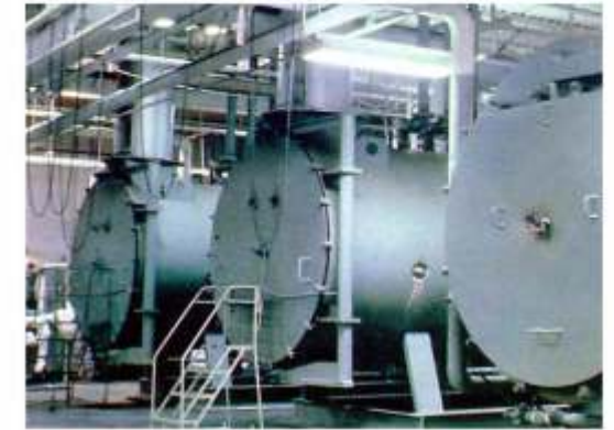
Boiler Water Treatment

Water quality monitoring products ensure accurate analysis of water, essential for maintenance of boilers, cooling towers, softeners and demineralisers. These are available as individual outfits, combination kits and refills.