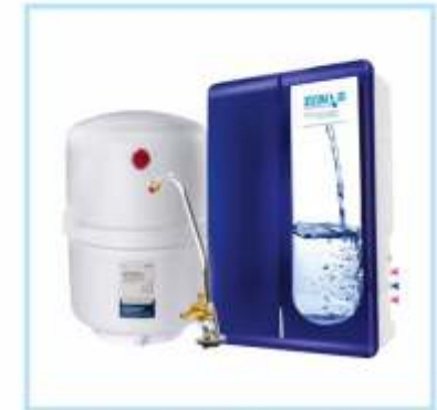
Zero B Kitchen Mate