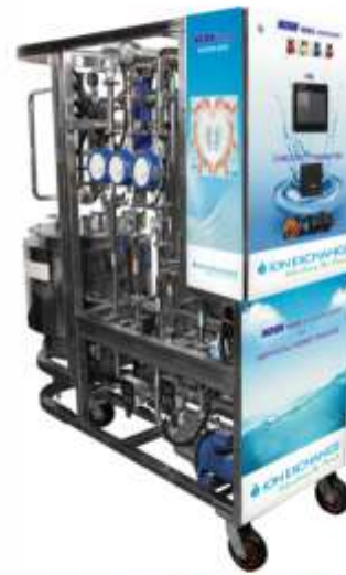
Ultrapure Water for Artificial Kidney Dialysis