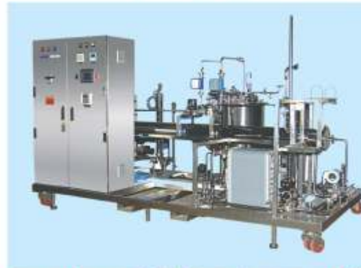
Reverse Osmosis (RO) Electrodeionisation (EDI) for Pharmaceutical and Electronics Industries