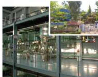
Industrial Chemical Division at Patancheru, Telangana