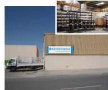
Assembly Unit at Sharjah, UAE