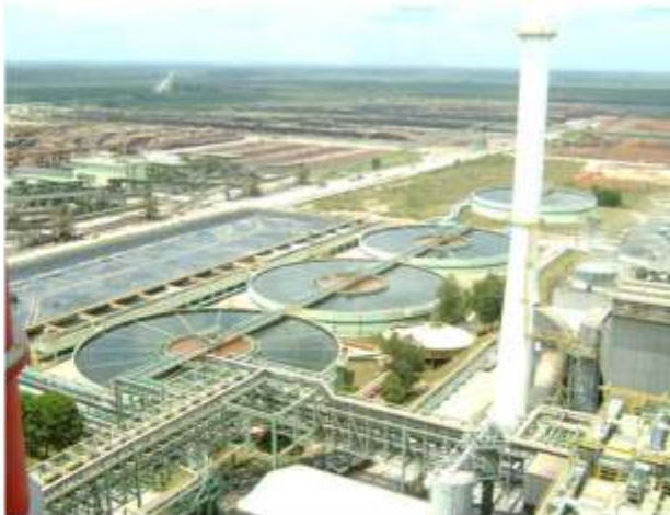
High Rate Solid Contact Clarifiers for Paper Industry

If we want a sustainable future for coming generations, there is a need to protect the environment and conserve natural resources. We help industries to use their water and energy resources more efficiently and provide solutions that address the needs of each customer. Through quantifiable benefits we have demonstrated time and again that efficient water and environment management is a value investment.