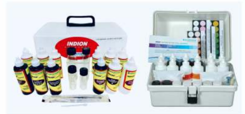
Water Test Kits and Refills