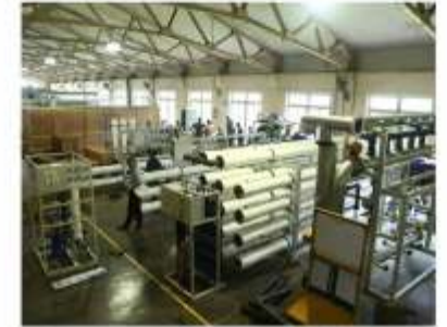
Fabrication & Assembly Facility at Verna, Goa