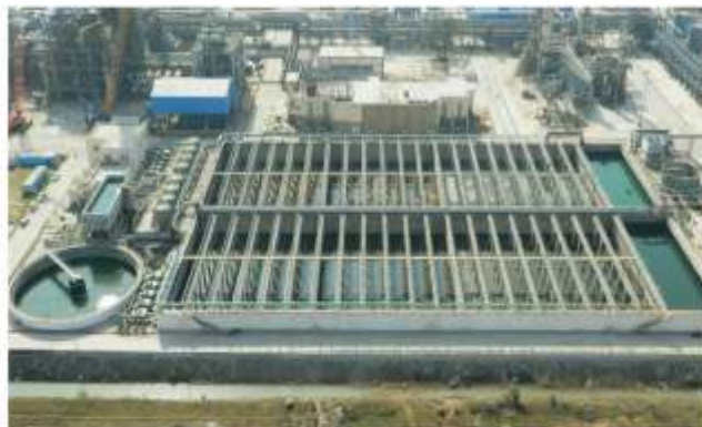
Effluent Treatment Plant for Steel Industry