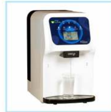
Zero B Hydrolife