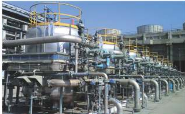
Demineralisation Plant at Petroleum Industry