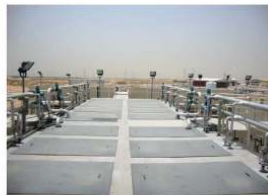
Membrane Bioreactor Plant at Industrial Area