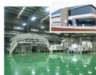
Membrane Manufacturing Unit at Verna, Goa