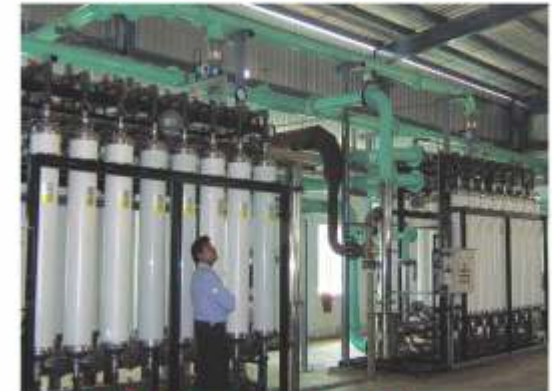
Ultra Filtration at Paper Industry