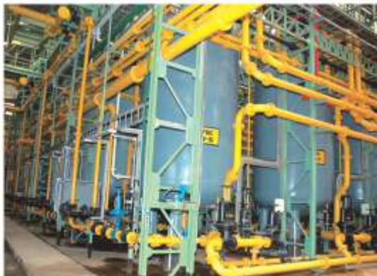
Uranium Recovery Plant at Mining Industry