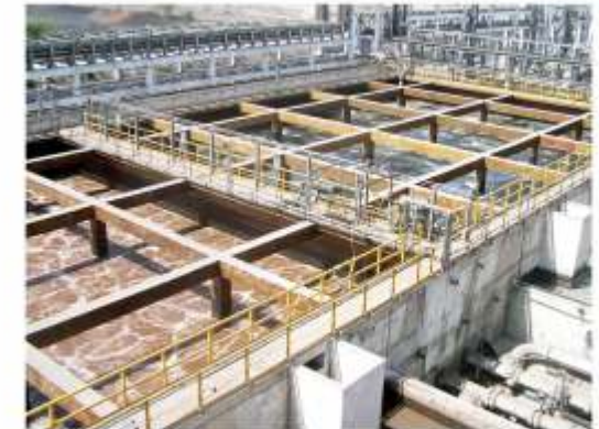
Effluent Treatment Plant at Refinery

Solutions integrate physicochemical, biological and membrane separation processes for optimum water recovery. These include micro filtration, ultra filtration, nano filtration and reverse osmosis systems, membrane bioreactors and advanced photochemical oxidation.