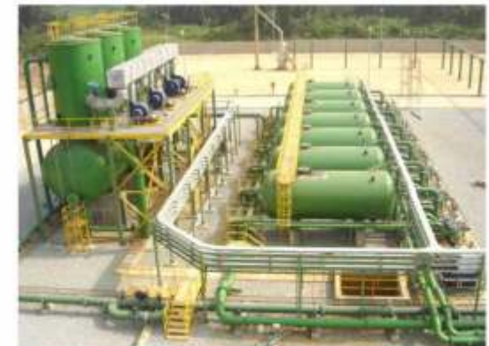
Filtration System at Power Plant