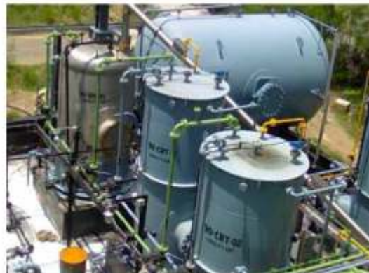
Boron Enrichment Plant for Heavy Water Board