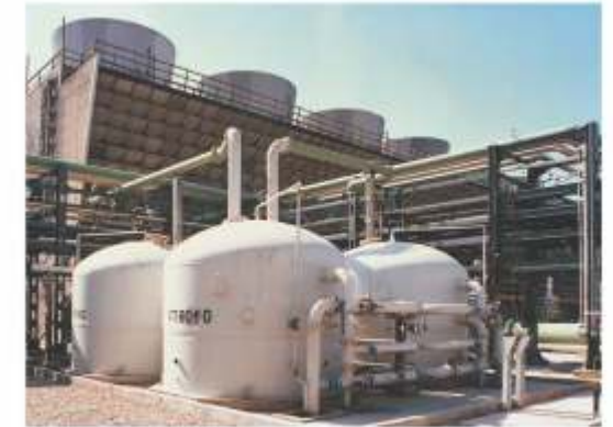
Cooling Water Treatment