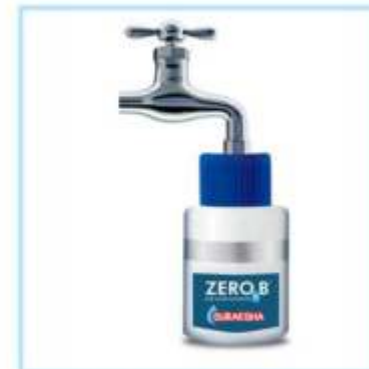
Zero B Suraksha Tap Attachment