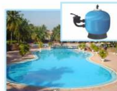
Swimming Pool Filters