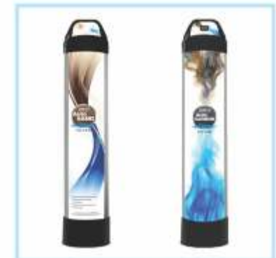
Zero B AutoSand & AutoCarbon Filter