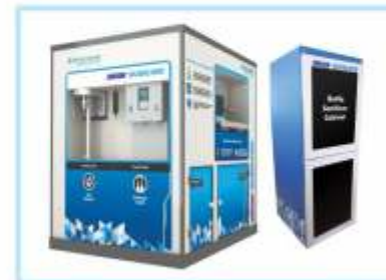
Compact Unit for Purification and Bottling of Drinking Water