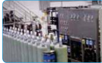
INDION® PF/DT Reverse Osmosis System