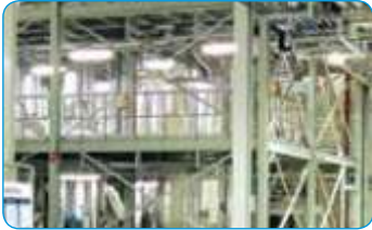
INDION® Multi-Effect Evaporator (MEE)

Ion Exchange (India) Ltd. offers a complete portfolio of advanced environmental products, solutions and services for industrial, institutions and municipal segments. Technology solutions encompass water, liquid, gaseous effluents, solid waste, bio-solids and renewable energy, while services include consultancy, turnkey contracting, O&M and BOOT projects.