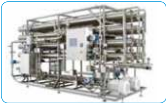
INDION® Integrated Dye Desalting, Water Recovery & ZLD System