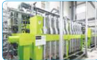
Electrodialysis Reversal (EDR)

* In collaboration with ASTOM ASTOM Corporation