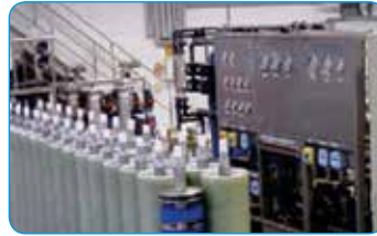
INDION ® Plate Frame (DT/PF) RO system*

* In collaboration with Rochem Group S.A.