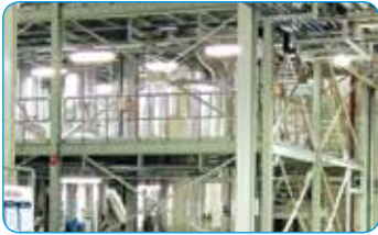
INDION ® Multi-Effect Evaporator (MEE)

Ion Exchange (India) Ltd. offers a complete portfolio of advanced environmental products, solutions and services for industrial, institutions and municipal segments. Technology solutions encompass water, liquid, gaseous effluents, solid waste, bio-solids and renewable energy, while services include consultancy, turnkey contracting, O&M and BOOT projects.