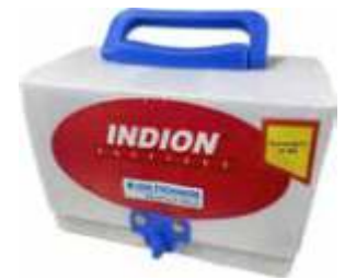
INDION® Easy Test Kit

Specially designed for on-the-spot analysis of cooling water without a trained chemist