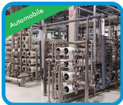
Kia Motors Capacity: 150 m 3 /d