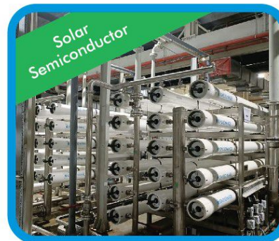
First Solar Capacity: : 300 m 3 /d