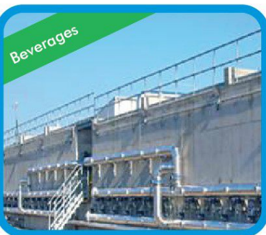
United Breweries Ltd. Capacity: 84 m 3 /h