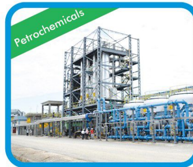
Indian Synthetic Rubber Ltd. Capacity: 3 MLD