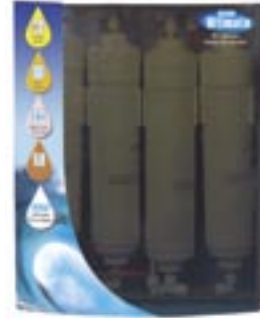
Zero B Pristine UTS (Under the Sink)

Listed as number one in the consumer loyalty segment, Zero B continues to quench the thirst of many Indian families, in the healthiest possible way, winning some awards and many hearts along the way.