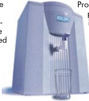
Zero B Pristine ROp

survey covered over 12,000 households across the country and was conducted by AMGF Inter Corp along with TNS India as their research partners and analysts. Ernst and Young was the tabulation process validator.