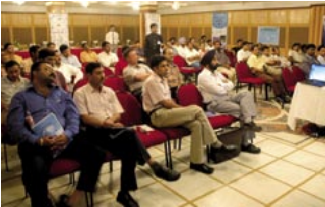
Participants at an IESL customer meet.

To strengthen its association with customers – its business partners, IESL organised a series of customer meets on the theme With You, Right Through in cities across India including Goa, Bangalore, Pondicherry, Chennai, Kochi, Aurangabad, Delhi, Chandigarh and Durgapur. The focus of these events was the need of water and