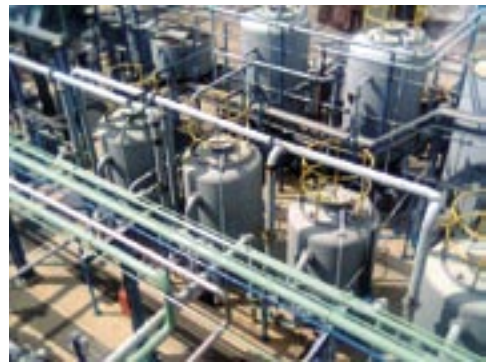
Auto DM plant, 2 x 16.25 m 3 /h, at St. Gobain Glass India Ltd., Sriperumbudur, Tamil Nadu.

For Hindalco Industries Limited, Hirakud, Orissa , a 1000 m 3 /h pretreatment plant with 1008 m 3 /h lamella clarifier, 4 x 250 m 3 /h multigrade filters and 2 x 250 m 3 /h softeners. Also, two streams of 118 m 3 /h DM plant.