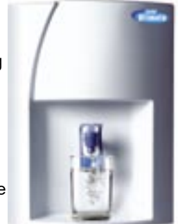
Zero B Ultimate RO