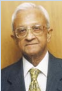
Lifetime Achievement Award

"As predicted in Rachel Carson's Silent Spring 45 years ago and Limits To Growth by the Club Of Rome, the exponential growth of industrialisation