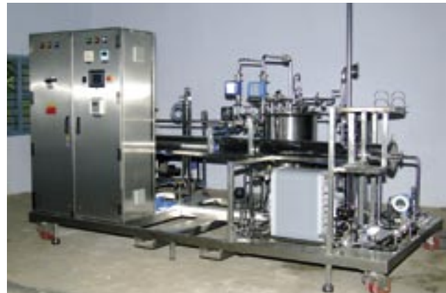
USP 28 pharma grade automatic RO-EDI system at Royce Pharma Manufacturing Sdn. Bhd., Malaysia.