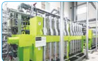
Electrodialysis Reversal (EDR)

* In collaboration with ASTOM ASTOM Corporation