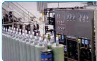
INDION® PF/DT Reverse Osmosis System