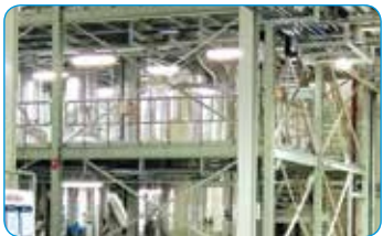
INDION® Multi-Effect Evaporator (MEE)

Ion Exchange (India) Ltd. offers a complete portfolio of advanced environmental products, solutions and services for industrial, institutions and municipal segments. Technology solutions encompass water, liquid, gaseous effluents, solid waste, bio-solids and renewable energy, while services include consultancy, turnkey contracting, O&M and BOOT projects.