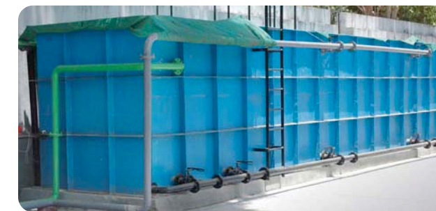
INDION Fluidised Media Reactor

We also offer packaged sewage treatment plant based on advanced proprietary fluidised media reactor (FMR), MBBR and membrane bio-reactor (MBR) process for higher capacities - flow rates.