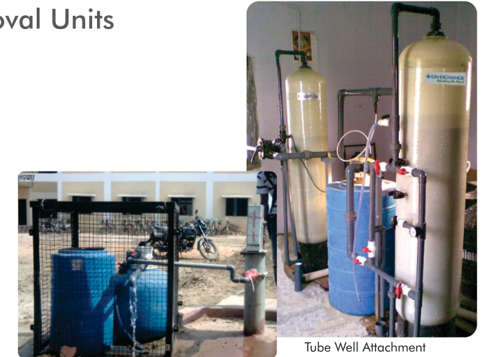
Hand Pump Attachment