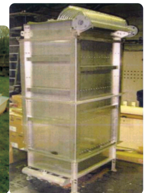
INDION Membrane Bio-Reactor