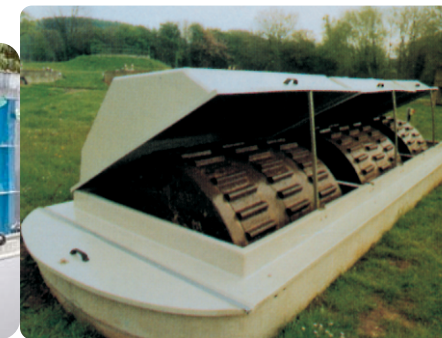
INDION New Generation Packaged Sewage Treatment Plant (NGPSTP)