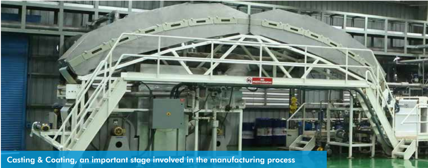
Casting & Coating, an important stage involved in the manufacturing process