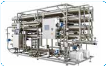
INDION Integrated Dye Desalting, Water Recovery & ZLD System

* In collaboration with Rochem Group S.A.