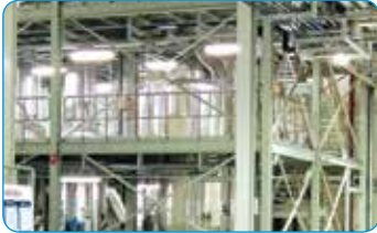
INDION Multi-Effect Evaporator (MEE)

Ion Exchange (India) Ltd. offers a complete portfolio of advanced environmental products, solutions and services for industrial, institutions and municipal segments. Technology solutions encompass water, liquid, gaseous effluents, solid waste, bio-solids and renewable energy, while services include consultancy, turnkey contracting, O&M and BOOT projects.