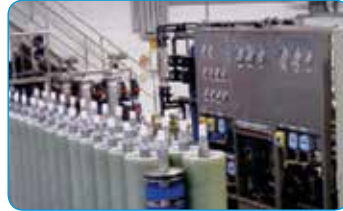
INDION Plate Frame (DT/PF) RO system*

* In collaboration with Rochem Group S.A.