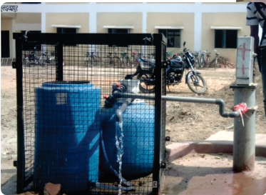
Hand Pump Attachment