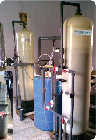
Tube Well Attachment