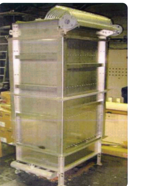
INDION Membrane Bio-Reactor