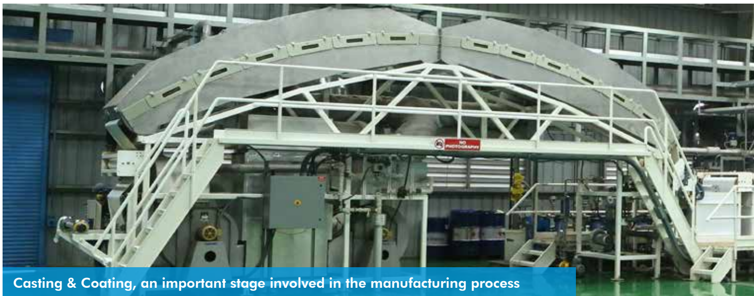
Casting & Coating, an important stage involved in the manufacturing process