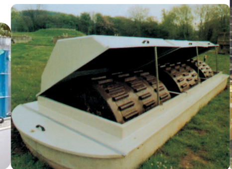
INDION New Generation Packaged Sewage Treatment Plant (NGPSTP)