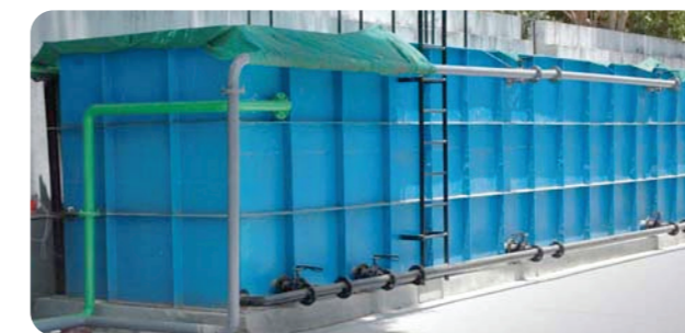
INDION Fluidised Media Reactor

We also offer packaged sewage treatment plant based on advanced proprietary fluidised media reactor (FMR), MBBR and membrane bio-reactor (MBR) process for higher capacities - flow rates.