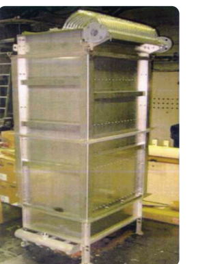
INDION Membrane Bio-Reactor