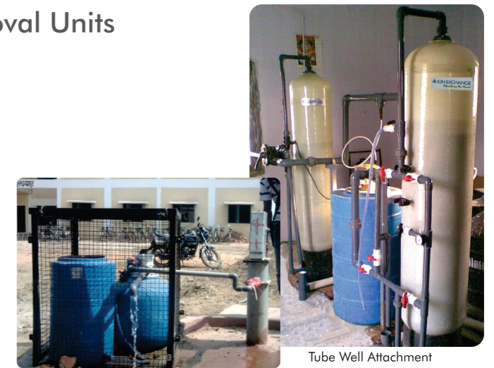
Hand Pump Attachment